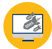
分散式阻斷服務攻擊