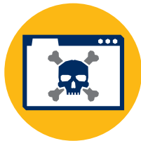
Figure 1: Security threats faced by enterprises & SMEs

from C-level executives and IT security managers of organizations across Asia and Australia. It also found that there was an increase in C-level executives taking responsibility for security breaches. The report showed that 59% of the organizations surveyed in Asia last year experienced a business interrupting security breach at least once a month. In the upcoming years, enterprises will continue to face security threats (see figure 1). As email is the major communication channel for businesses, phishing emails remain the most popular method to deliver malware.