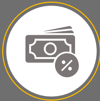
Tax compliance and advisory

Our real estate specialists can draw on many years' experience to help you navigate the changing landscape, mitigate risks and achieve your objectives.