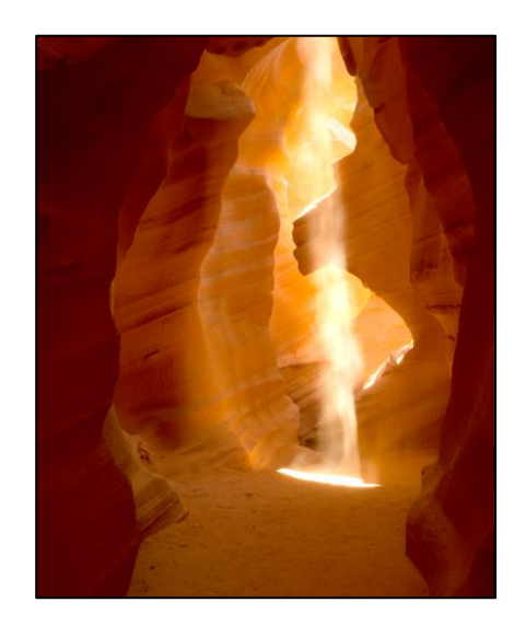
Click on the image to download PDF