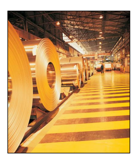
Click on the image to download PDF