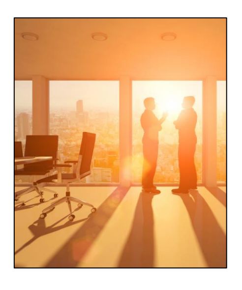
Click on the image to download PDF