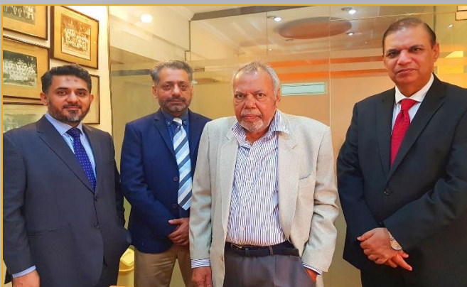
ICAP's 60 th Anniversary Celebration, July 2021