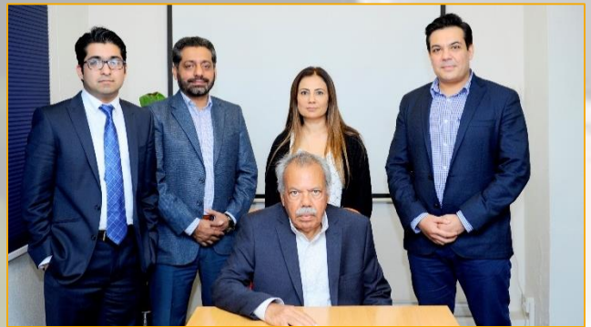
Internal Meeting on Technology, December 2016