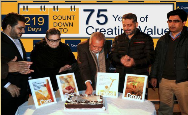
Kick-off Celebrations for Firm's 75 th Anniversary, January 2022