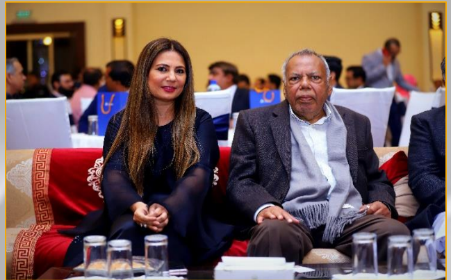
Alumni Dinner, February 2022