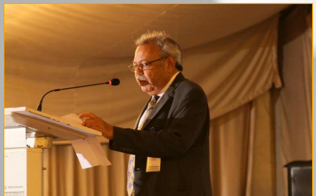
Alumni Dinner, 2013