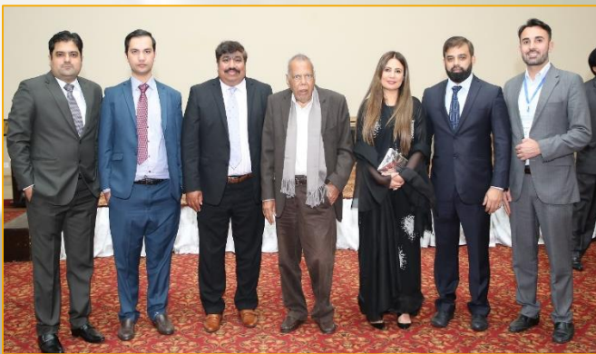
With Tax Team, February 2022