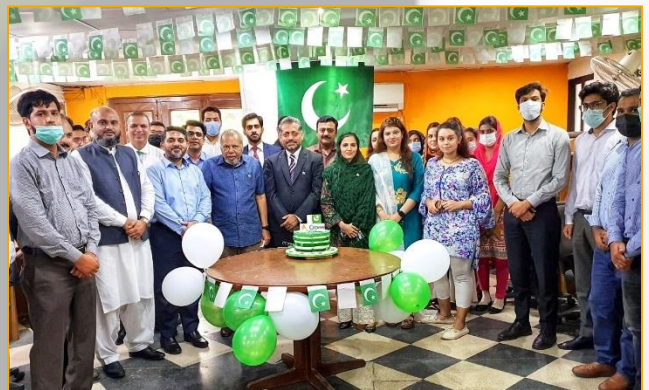
Independence Day Celebrations, August 2021