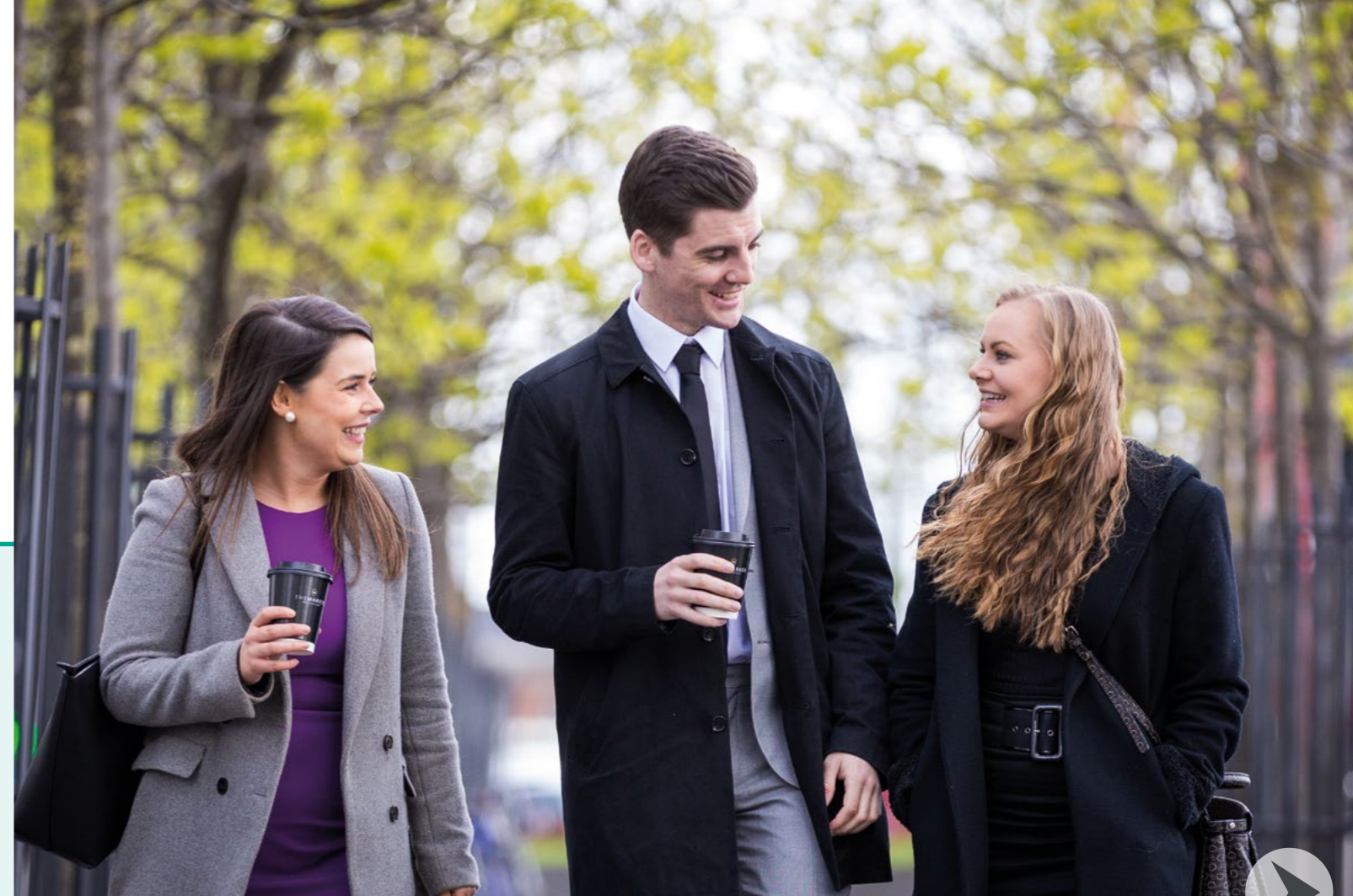
Build a high-trust workplace to find and retain staff.

disruptive and lead to a perceived lack of control. High-trust managers understand this and create opportunities for employees to take part in the decision-making process.