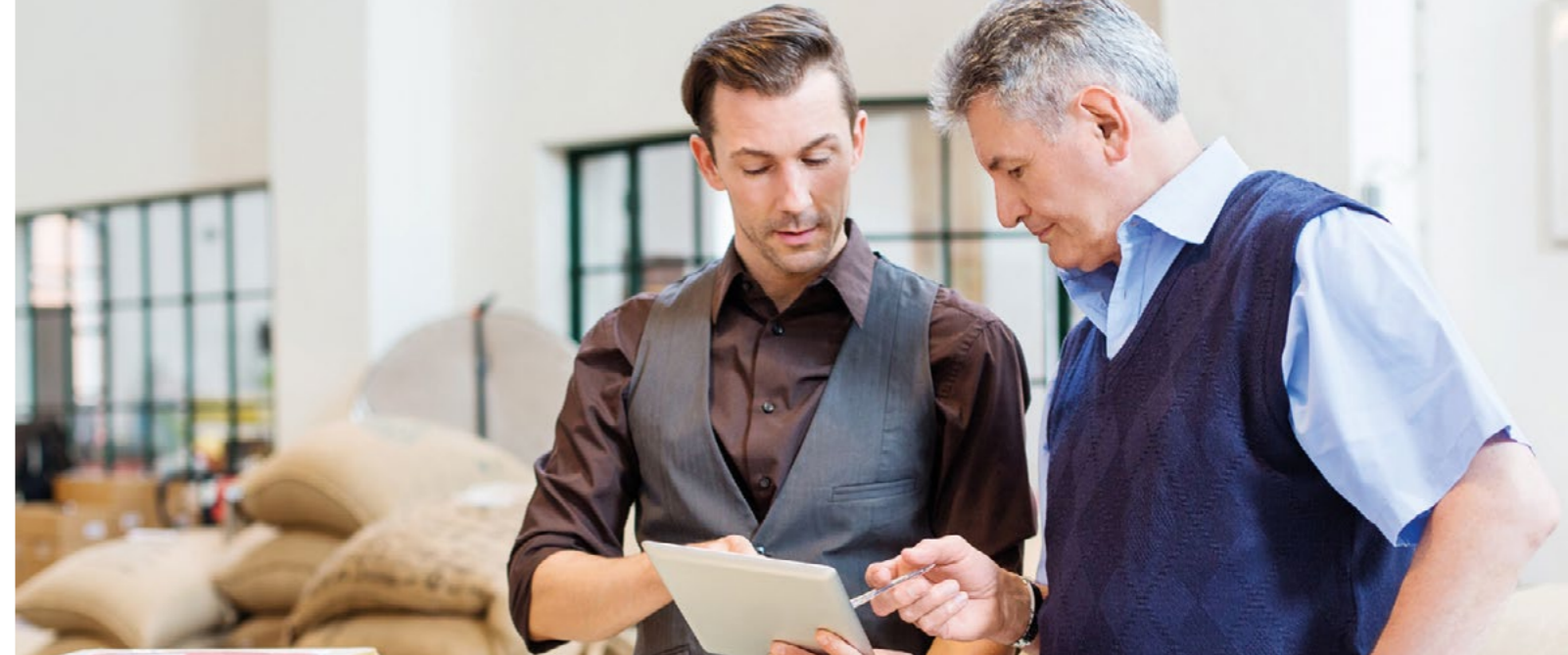
A well-structured succession strategy will ensure stability within the family business.

For most business owners their largest and most important asset is their business. As a result, there are few more important considerations when building and growing a business than the owner's eventual exit.