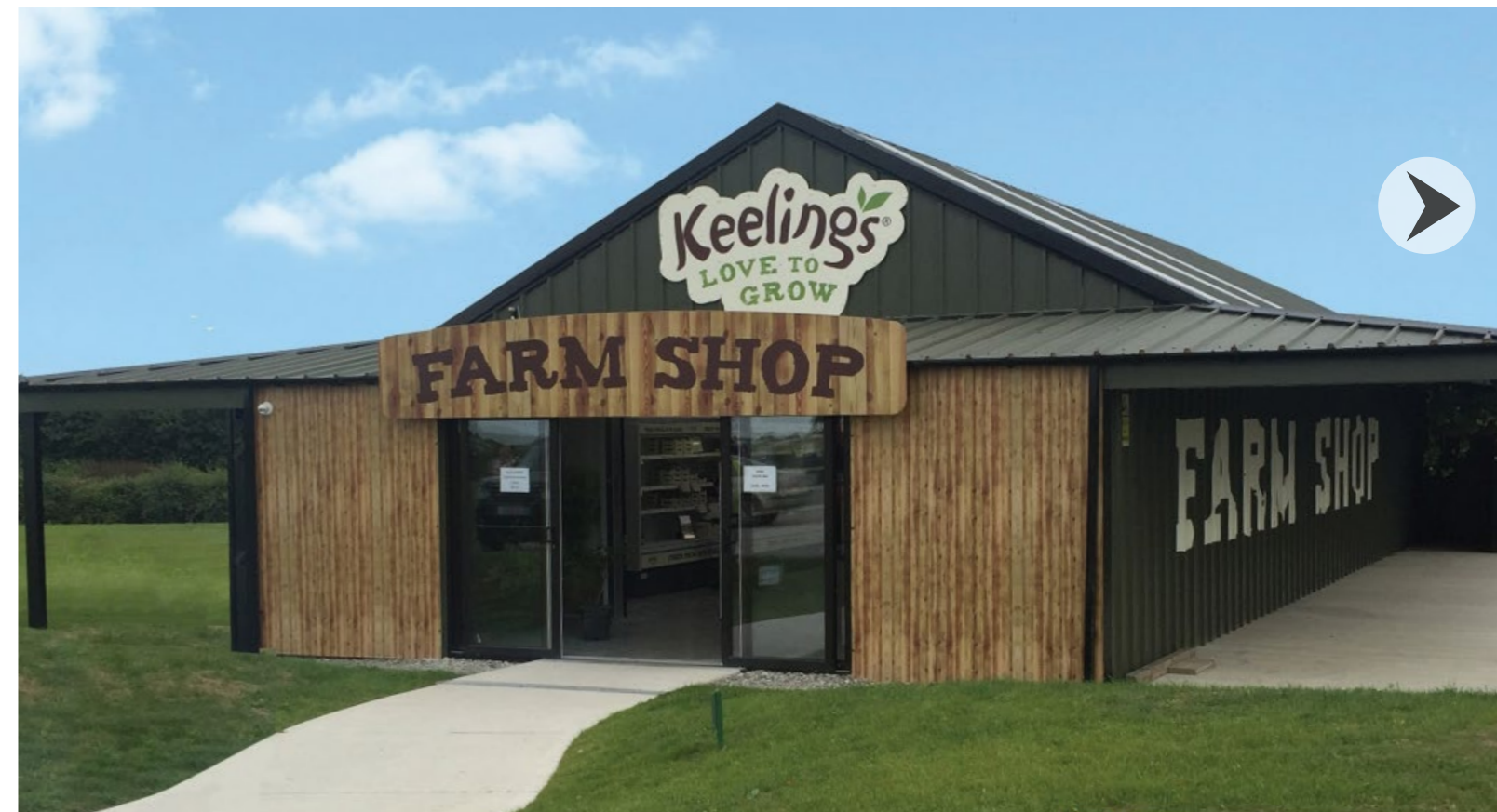
The Keelings farm shop.