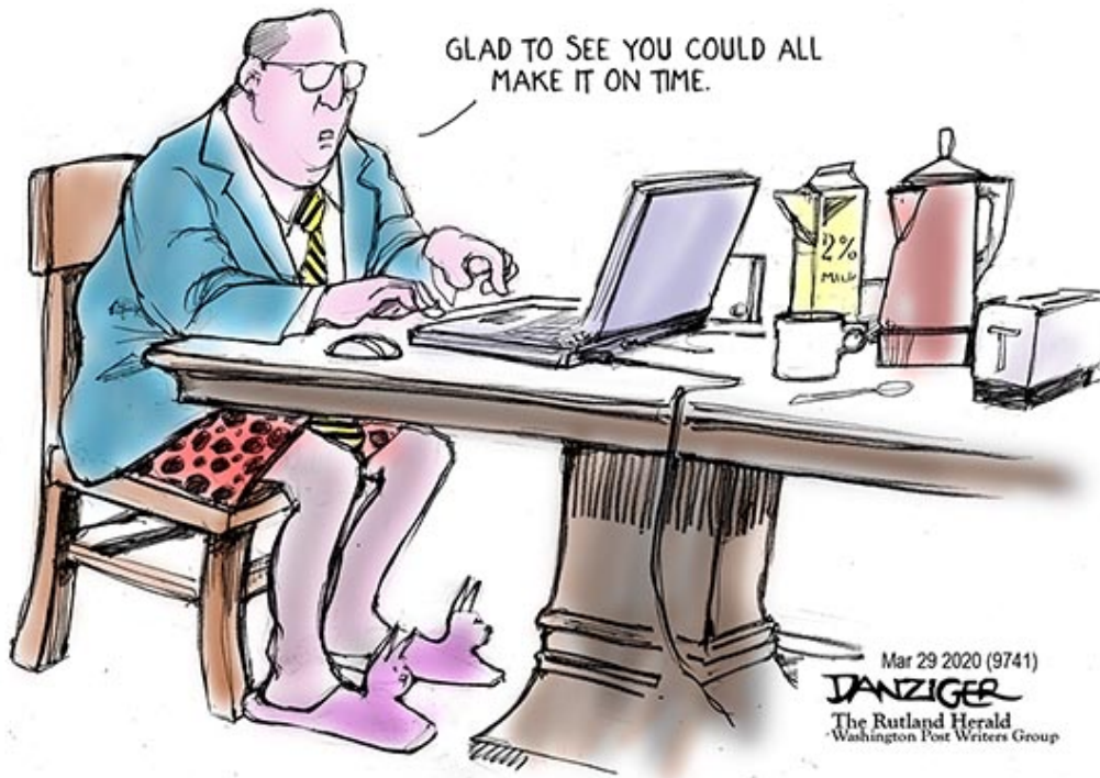
Early Zoom Meeting

Do You Have 'Zoom Fatigue' or Is It Existentially Crushing to Pretend Life Is Normal as the World Burns?